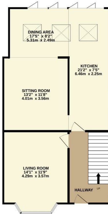
GROUND FLOOR 667 sq.ft. (62.0 sq.m.) approx.